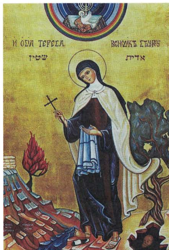
Icon of Edith Stein written by the Carmel of the Theotokos, Harissa, Lebanon; distributed by the Postulation General of the Discalced Carmelite Order, Rome, Italy. The icon depicts Edith Stein/Teresa Benedicta of the Cross holding the traditional Jewish prayer shawl, or tallit , removing her sandals before the burning bush. She is shown with her Carmelite mantle grafted onto the Jewish olive tree stock from which Jesus was born. She holds the cross, symbolic of blessing in the New Covenant, of her title in religion "blessed by the Cross," and of her own journey to the cross and resurrection through her death in the Holocaust.

Her martyrdom unites her deeply to Jesus. We may have touched upon the surface of what her death really means but cannot know the totality of its depth and breath. So much of the mystery behind her life is yet to be revealed to us. Her faith and determination took her to this unplanned moment in her life in a distinct historical time. Her faith united to Jesus certainly is a collaboration