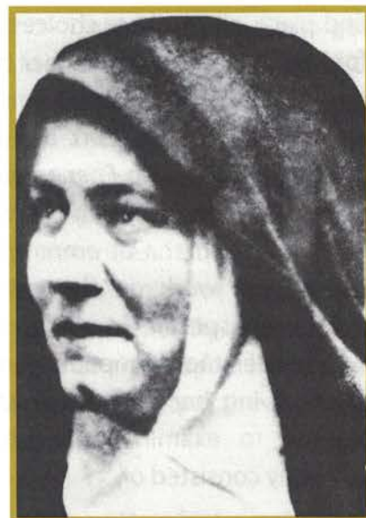
Last picture of Edith Stein. Spring or Summer 1942.