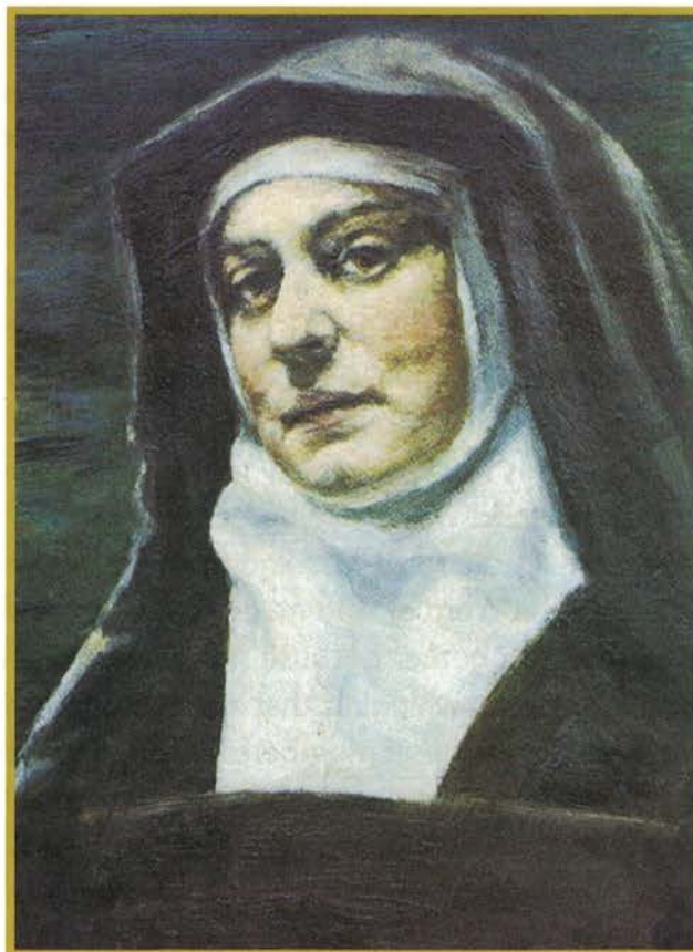
Contemporary rendering of Edith Stein, based on her passport photo.

"God is spirit, and those who worship him must worship in spirit and truth" (Jn 4:24). Referring to these words of Jesus spoken to the woman at the well, the pope compared them to Edith Stein's, "ascent to Mount Carmel." "The depth of the divine mystery became perceptible to her in the silence of contemplation," said the pope. "Gradually, throughout her life, as she grew in the knowledge of God, worshiping him in spirit and truth, she experienced ever more clearly her specific vocation