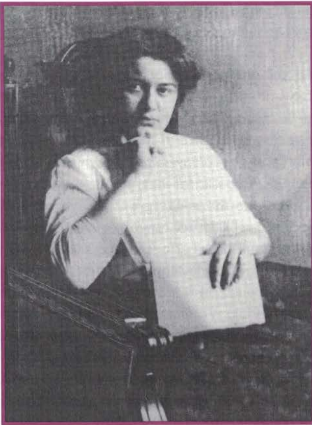
Edith in Göttingen, Winter semester 1913-14.

of the Source of all things—her recognition of the first reality and truth which is found in God alone. That same year, Husserl transferred to the University of Freiburg where he was called to the post of full professor. Unable to take her final examinations with the faculty she knew well at Göttingen, she took the examinations at Freiburg.