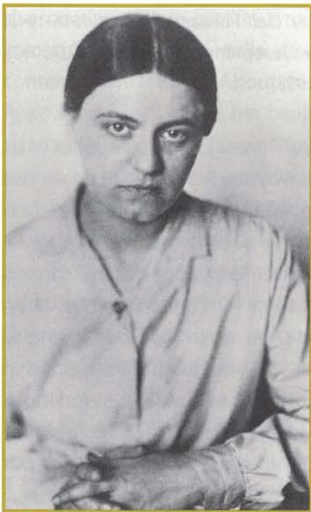
At a lecture on Elizabeth of Thuringia on May 30, 1931.