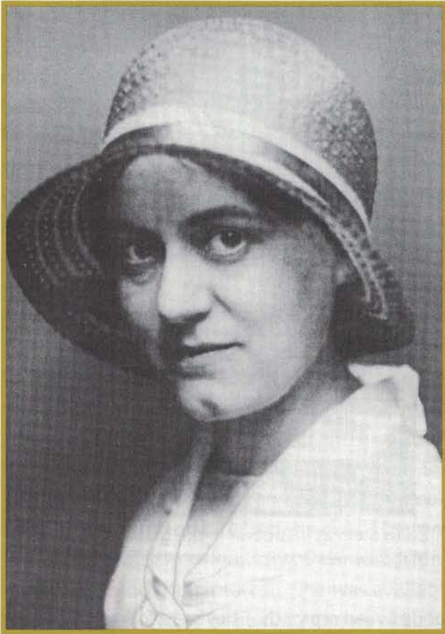
Edith Stein during her time in Speyer.

Two of the short letters that reached the nuns in Echt were written from Westerbork. On August 4, 1942, Drente-Westerbork, Barracks 36, Edith wrote: "Now we have a chance to experience a little how to live purely from within" (Stein 1993, 351). Two days later, her note had one simple request from the nuns, "I would like the next volume of the breviary (so far I have been able to pray gloriously)" (Stein 1993, 353).