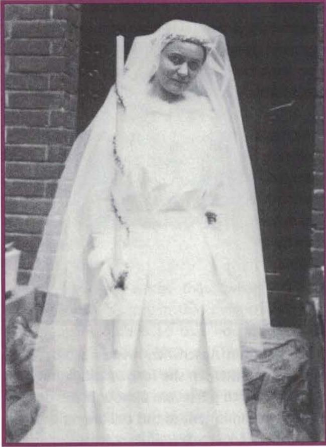
Edith Stein as a postulant wore a wedding dress as was the custom. The silk was later reworked into a vestment.

on Sunday, July 26, 1942, at all Masses, urgently requesting those in authority to dismiss the decree and not carry out its order. Because the bishops interfered, an order to deport all Catholic Jews by the end of the week was put into effect.