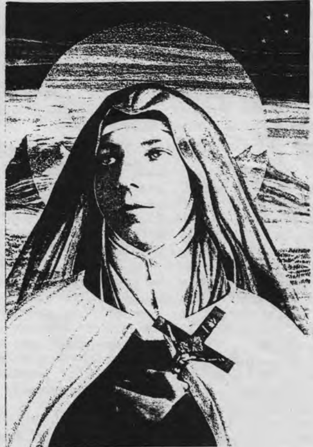
SAINT TERESA OF JESUS OF LOS ANDES

Many favors were attributed to her intercession. The diocesan process for her beatification was introduced in 1947; in 1986 Pope John Paul II promulgated the decree declaring her life to be one